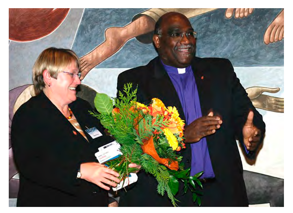
Bishop Rosemarie Wenner, left, visits with Bishop Gregory Palmer of the Illinois Great Rivers Conference.

The women's commission says that an important step in insuring universal rights for women in the global church is to insure "gender" as a protect category in the denomination's Constitution. GCSRW has tried unsuccessfully to petition General Conference to make this amendment; it will try again at the 2012 General Conference.