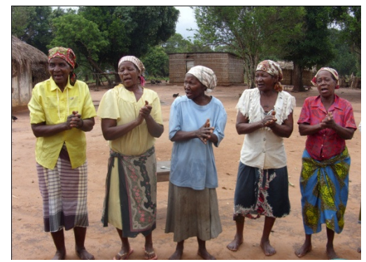
Residents of the United Methodist-run home for widows in Massinga, Mozambique, greet visitors with song. The home provides food, clothing, shelter and community for 26 women abandoned by their families after their husbands died.

Some of them were run out of town as they're neighbors threw stones.