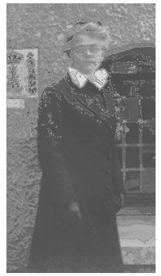
Deaconess in traditional garb

In the generations that followed, the deaconess office adapted with changing times. They left behind communal homes after World War I in favor of women's residence hotels. Their iconic uniform also lost its appeal in that era.