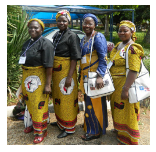
Women from Nigeria arrive at the consultation.