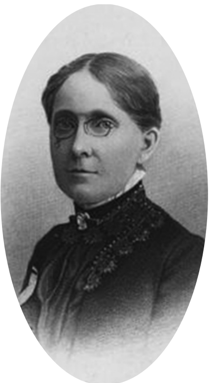
Frances E. Willard

No, according to the 1892 Methodist Episcopal Church's Committee on Judiciary. This was not the final word on gender equality in Methodism, but it was the last obstacle to seating women delegates at General Conference. The legislative tactic that eventually succeeded in allowing women full participation as delegates to Methodism's highest body provides an important parallel to our current debate about Amendment I regarding "Inclusiveness of the Church." This article of our Constitution does not currently guarantee gender inclusiveness in the UMC.