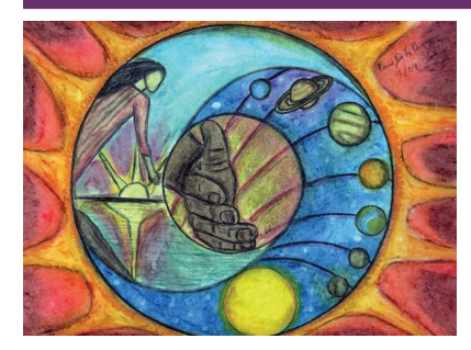
http://dlibrary.acu.edu.au/ staffhome/ankelly/Farid/From%20 Within%20Creation.jpg