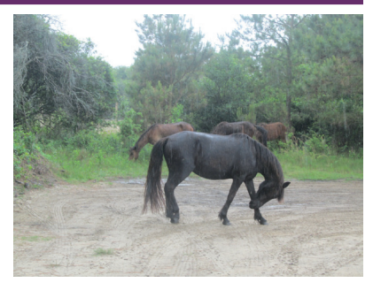
Horses at the Outer Banks beach under rainy day. (Aida Fernandez)